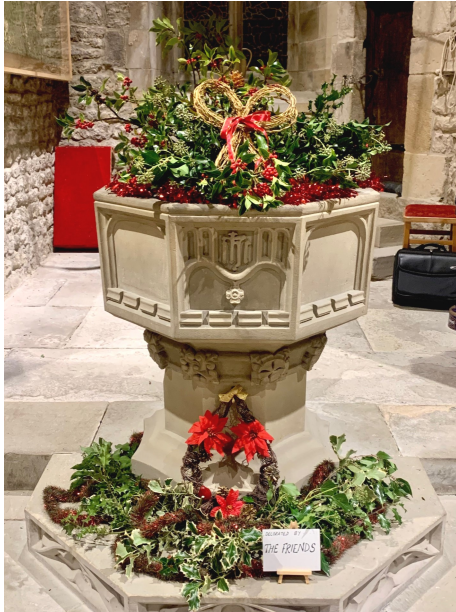
One of the lovely Christmas decorations