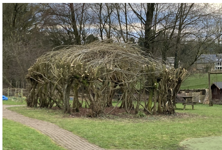
The Reflection Area at Melling School