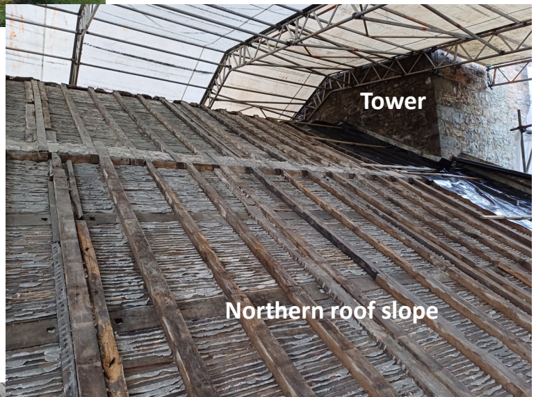
Northern roof slope

roof stripped - stone roof tiles and fixings in poor condition. Tiles unable to be reused so reclaimed tiles sourced.